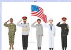
Memorial Day (U.S.) May 29